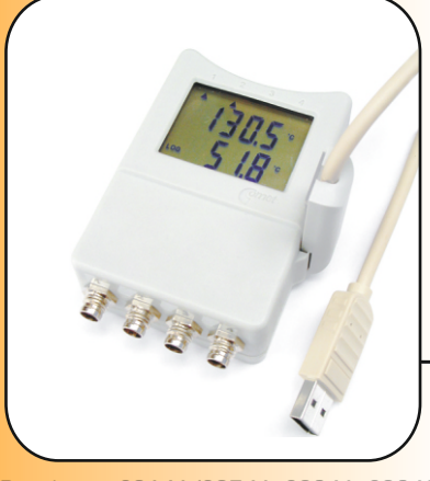
Data logger SO141 (SO541, SO841, SO842) with USB adapter