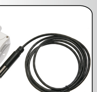
Fig.5 Transmitter T3419, T7411

Other accessories - see further Transmitters are directly compatible with sixteen channel Comet data acquisition system MSx.